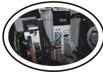
Panasonic Servo Driver