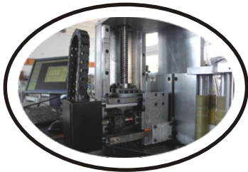
Stainless Steel Blade